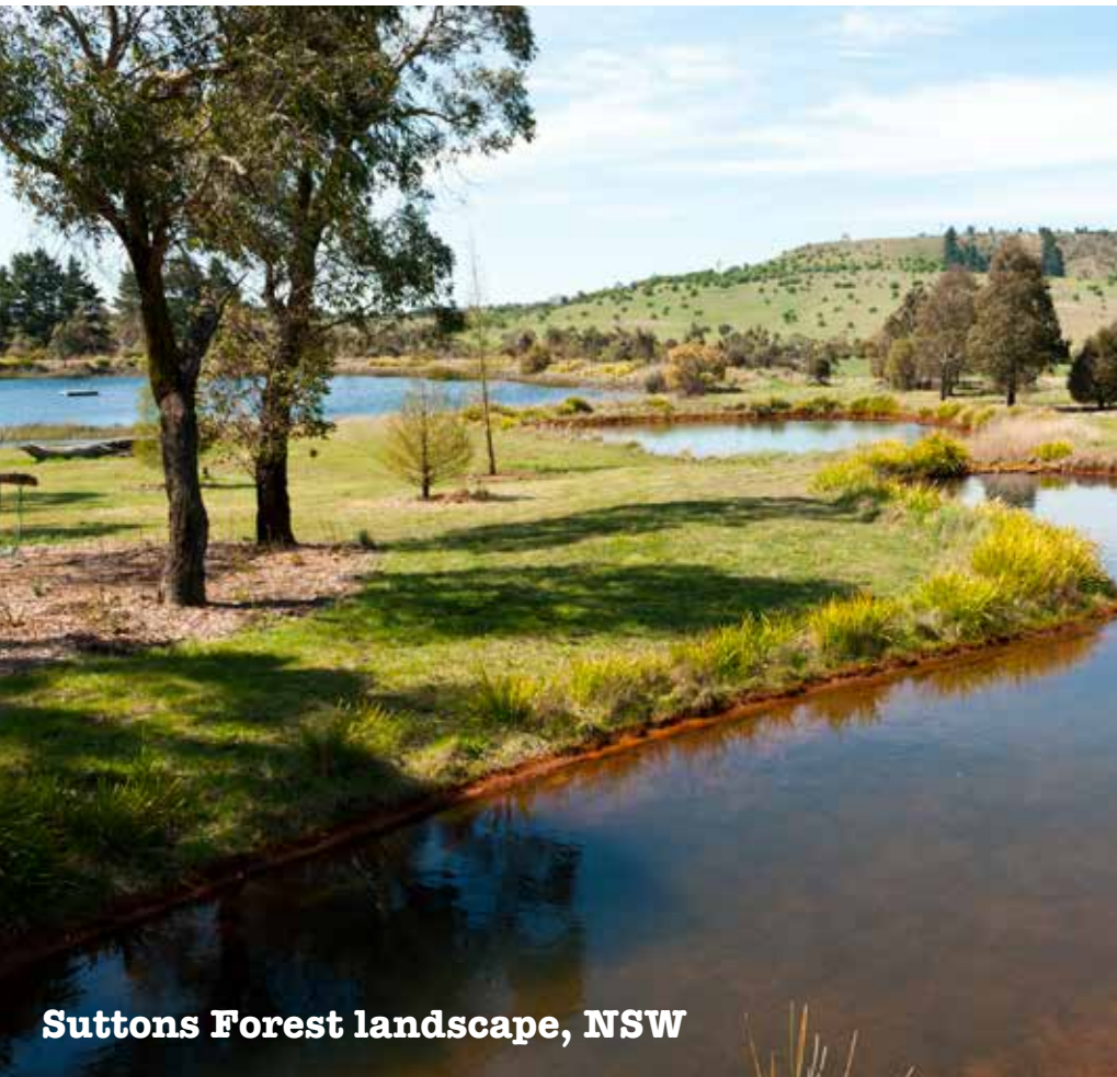
Suttons Forest landscape, NSW