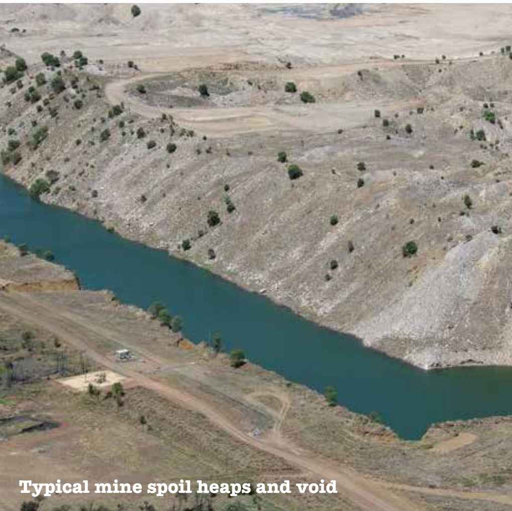
Typical mine spoil heaps and void