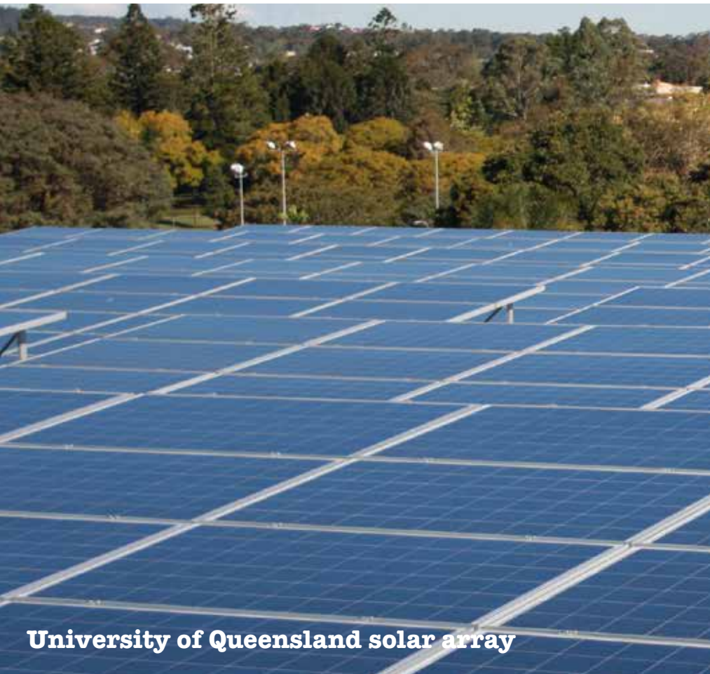
University of Queensland solar array