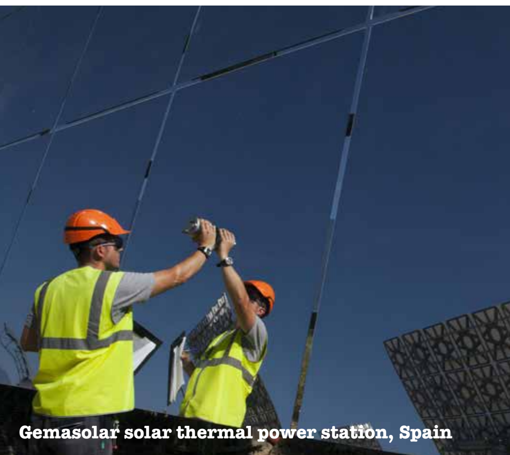
Gemasolar solar thermal power station, Spain