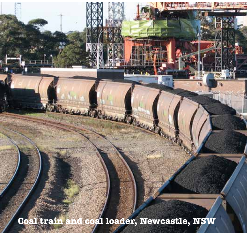
Coal train and coal loader, Newcastle, NSW