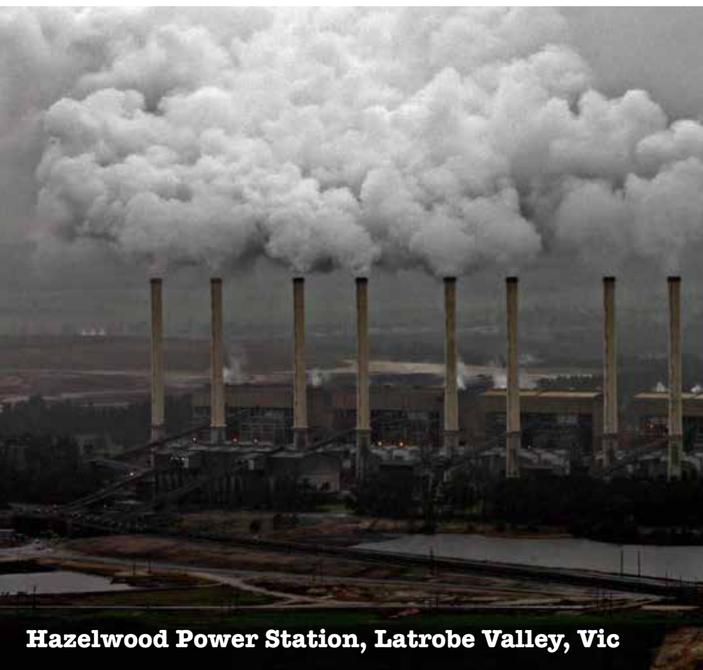
Hazelwood Power Station, Latrobe Valley, Vic

The Paris Climate Agreement, while deeply flawed, has been read as locking in the end of coal, with its promise to reach zero net emissions in the second half of the century impossible to achieve without closing the coal sector. A strategic reading of Paris is that such a geopolitical agreement could not have been reached in the absence of the growing civil society and market signals that coal's demise was already happening.