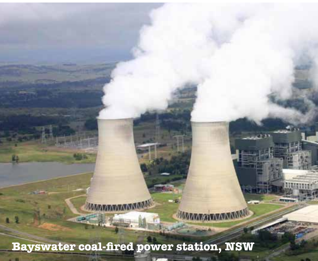
Bayswater coal-fired power station, NSW