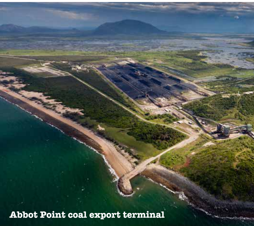
Abbot Point coal export terminal