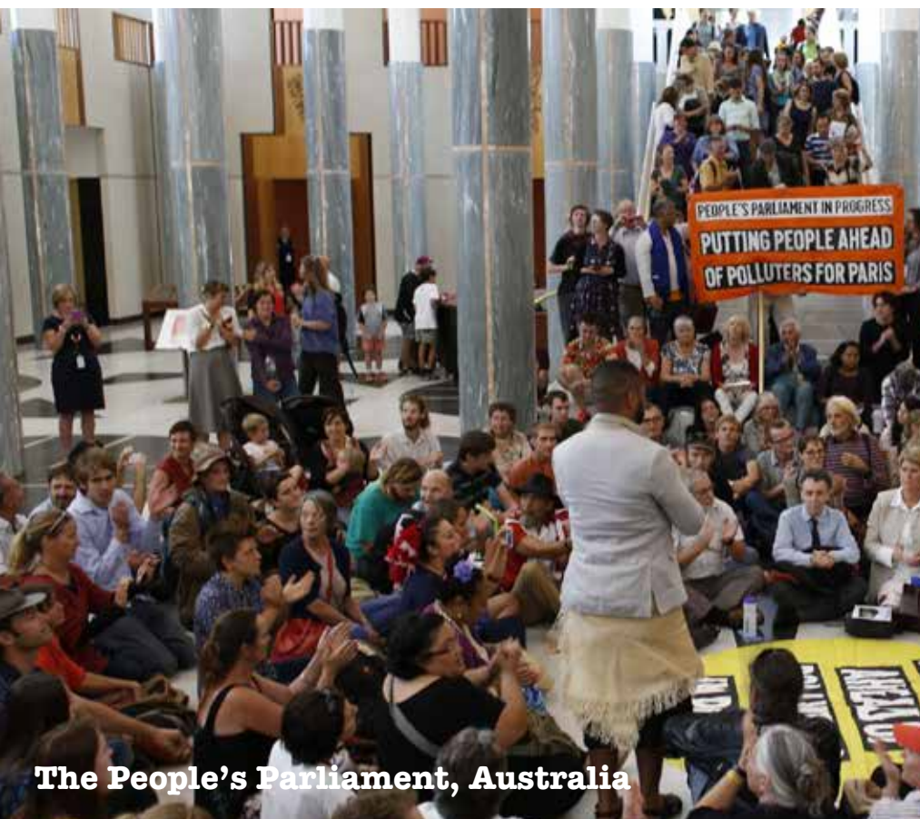
The People's Parliament, Australia