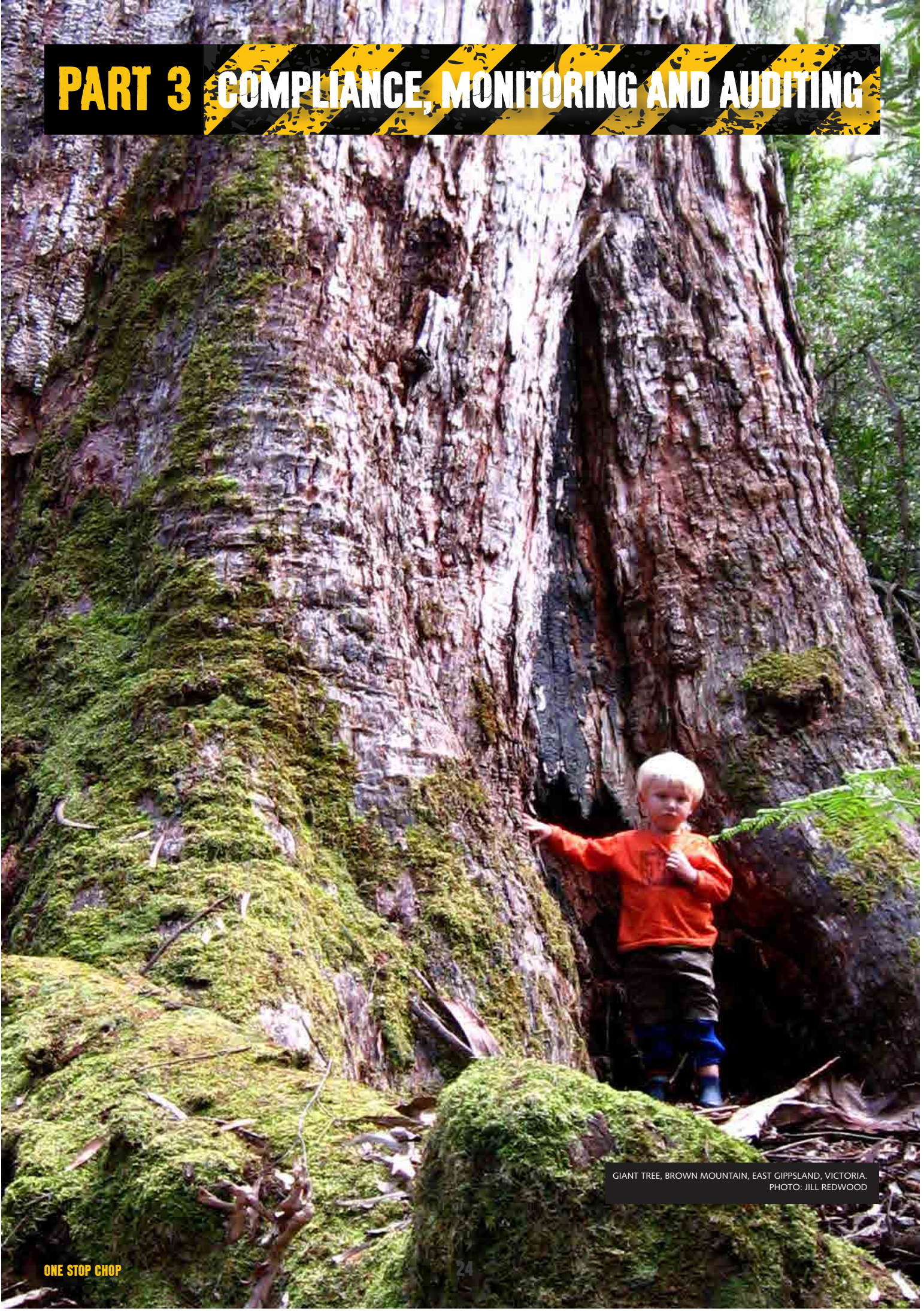
GIANT TREE, BROWN MOUNTAIN, EAST GIPPSLAND, VICTORIA.