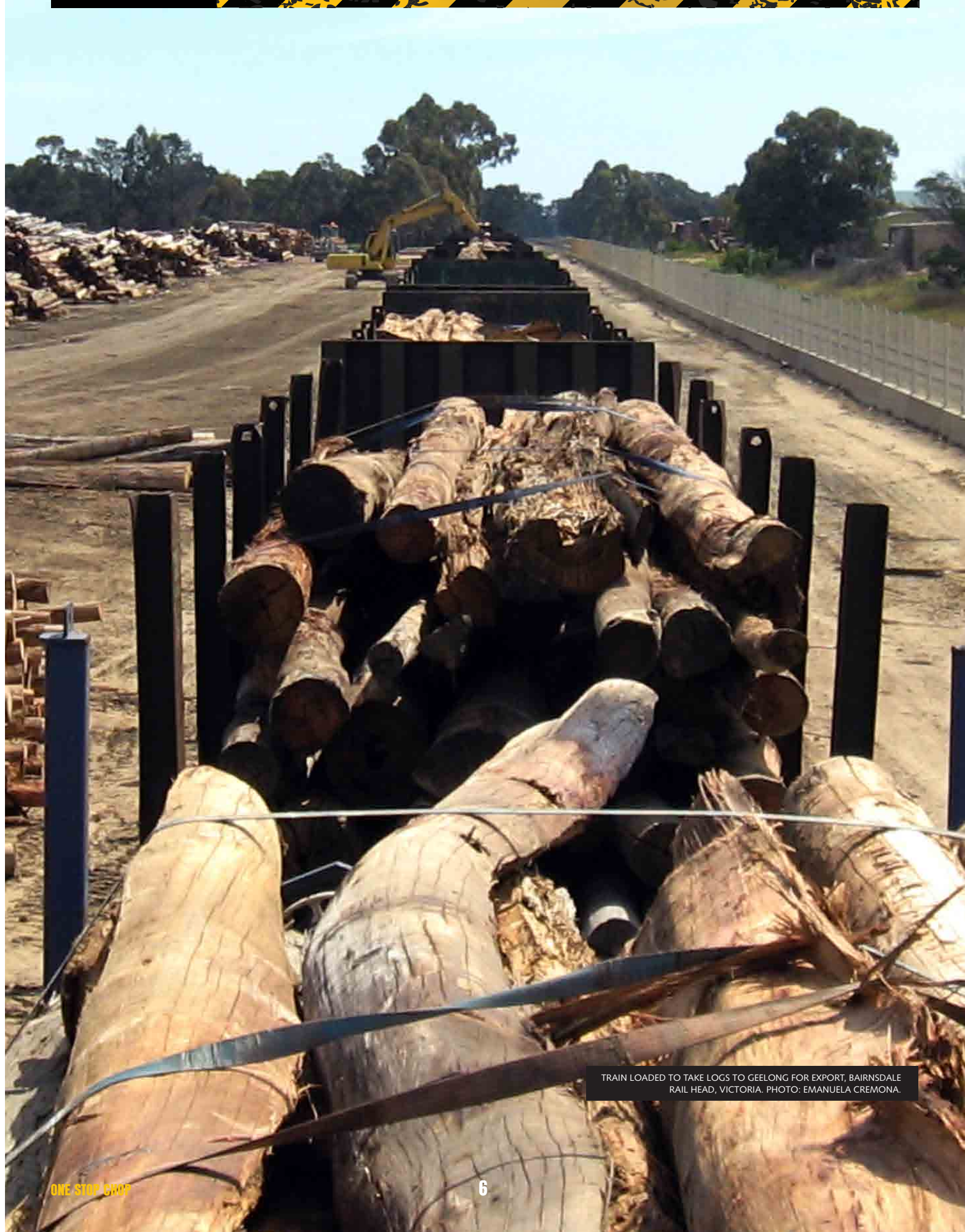
TRAIN LOADED TO TAKE LOGS TO GEELONG FOR EXPORT, BAIRNSDALE RAIL HEAD, VICTORIA.