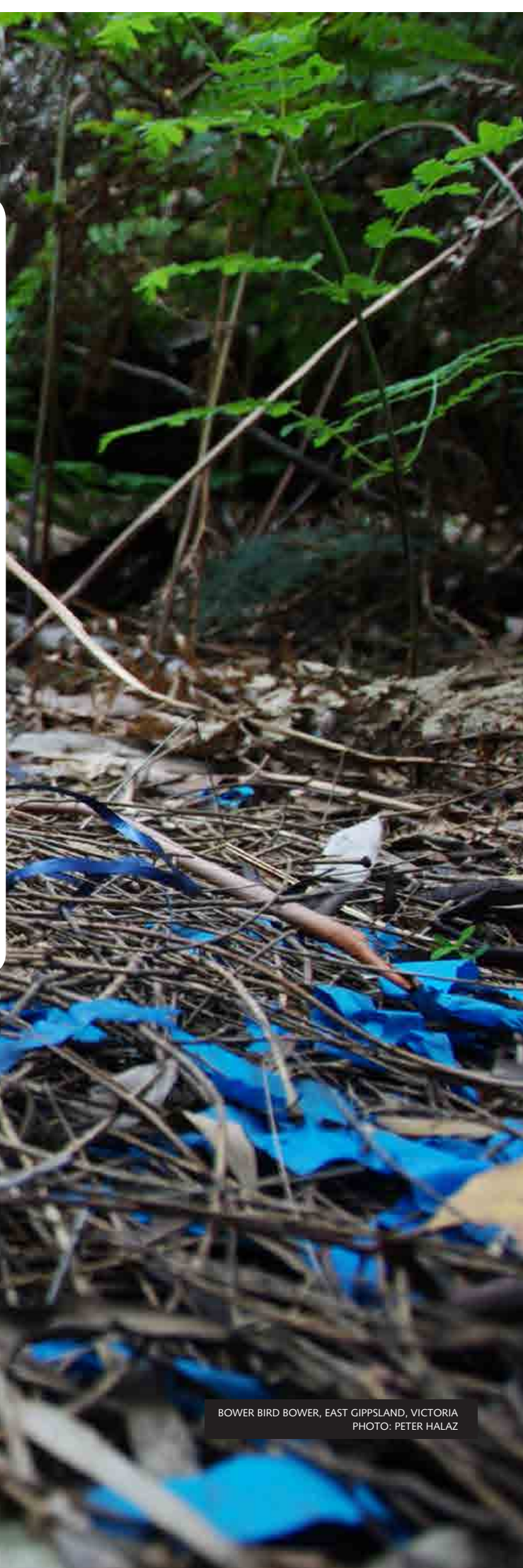
BOWER BIRD BOWER, EAST GIPPSLAND, VICTORIA

From a legal perspective, the main reason the RFAs have failed is that the States do not take the regulatory and legal actions required to adequately protect matters of national significance. This failing cannot be addressed by differently wording the RFA and strengthening States’ obligations: rather, the failure is fundamental to the concept of the RFAs and of devolving control of matters of national environmental significance from the Commonwealth to the States.