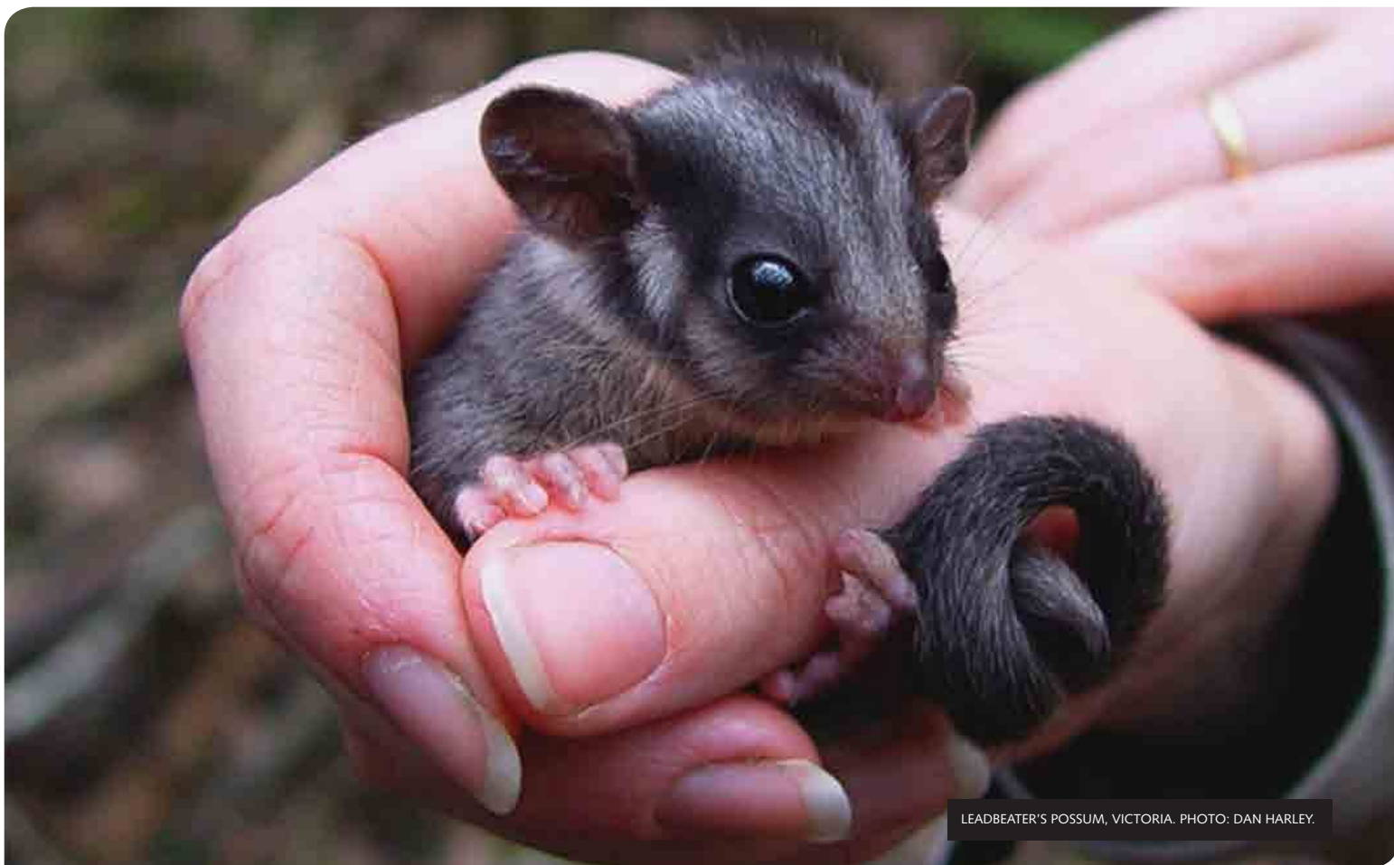
LEADBEATER'S POSSUM, VICTORIA.

are done in accordance with the approved policy, plan or program, approval of individual actions under Part 9 of the EPBC Act is not required.