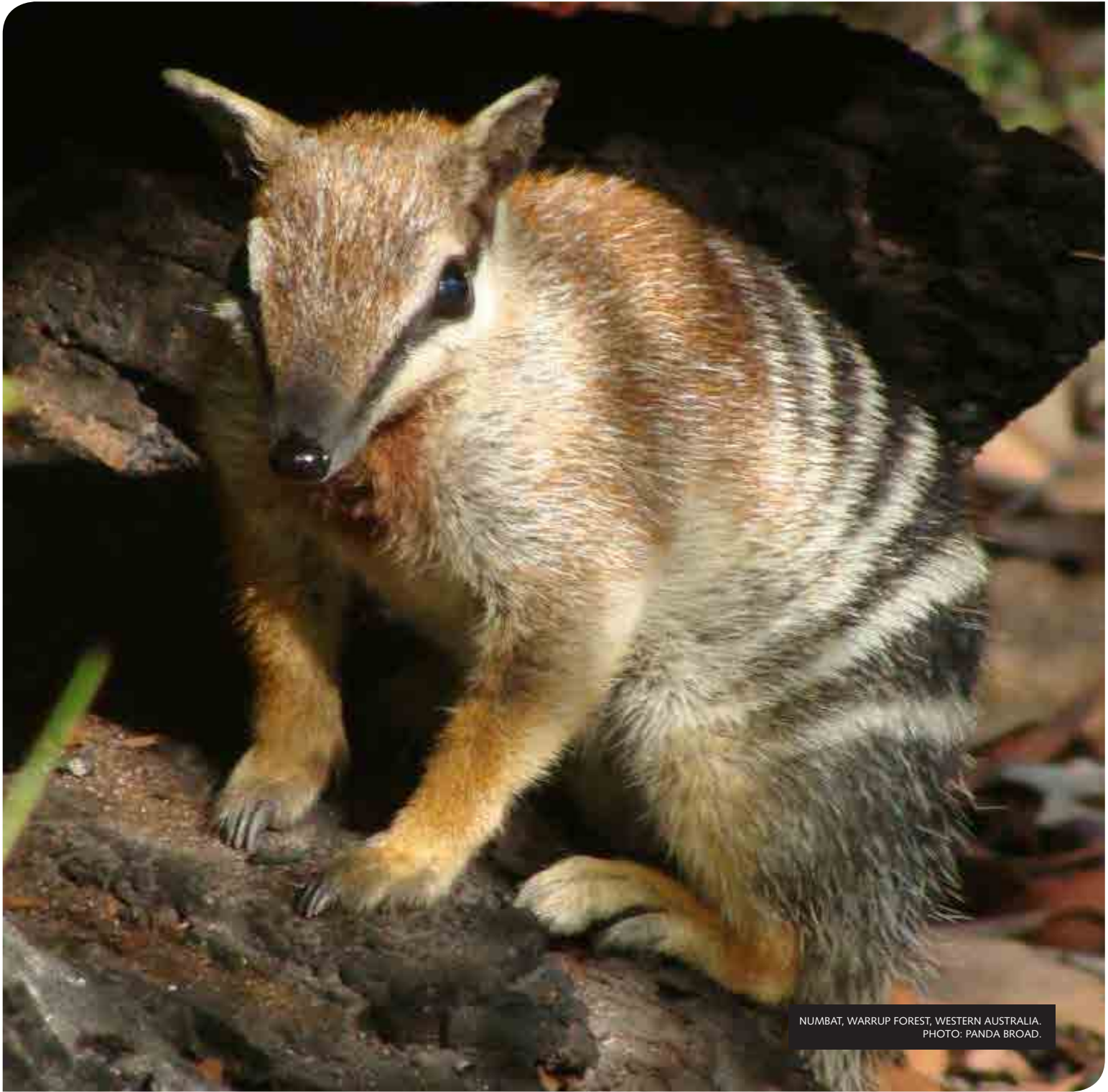
NUMBAT, WARRUP FOREST, WESTERN AUSTRALIA.

Significant procedural barriers and costs risks mean third party enforcement can only occur in limited circumstances, and be undertaken by groups with significant involvement and commitment to an issue, as well as access to significant resources. This means in circumstances where government is failing to enforce compliance with forestry laws, it is difficult for the community to pick up the slack. Nevertheless, there have been several instances when communities have taken enforcement proceedings and in doing so, have played an essential role in drawing attention to the failures of forestry agencies to comply with environment protection laws.