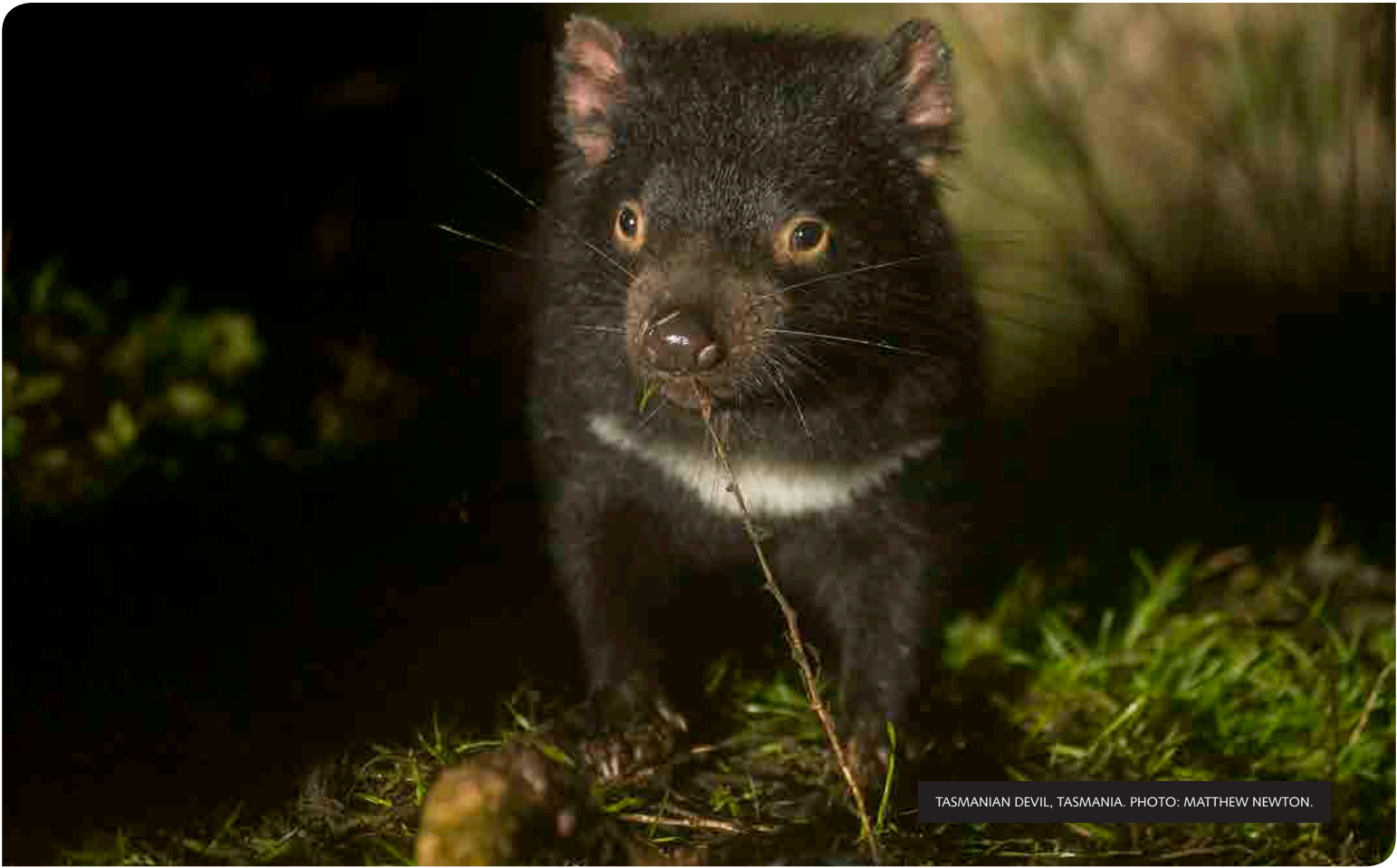
TASMANIAN DEVIL, TASMANIA.

senior zoologists in accordance with the Adviser are negotiable, if Forestry Tasmania objects.” (at [289]). He further noted (at [282]):